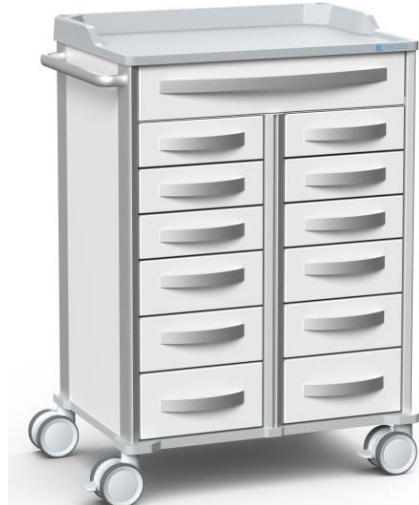
MPO Compact – double-purpose trolley