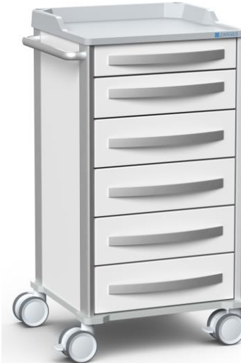
MPO Compact Plus - special purpose trolley