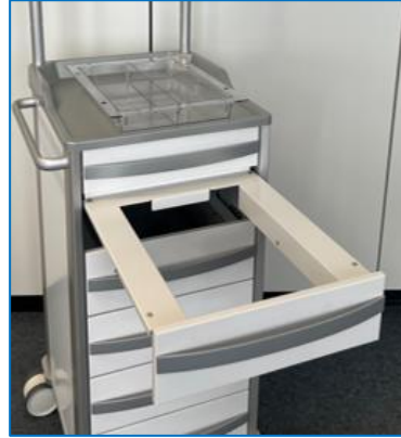
Drawers for standard ISO half modules