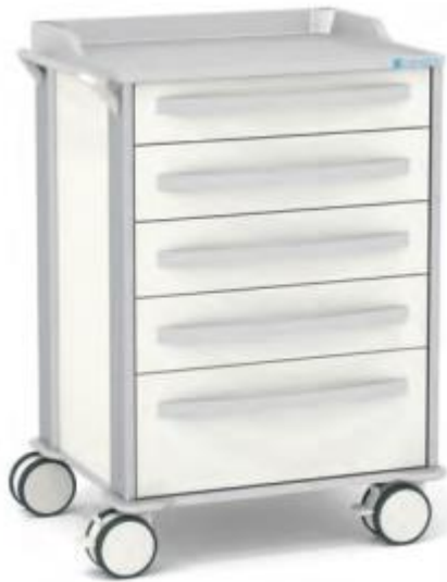
MPO Standard 1 ISO