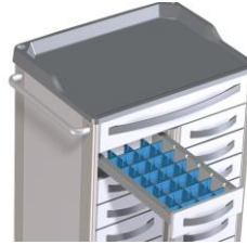
Half ISO drawer