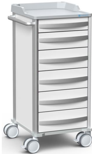
MPO Compact - Semi-ISO trolley