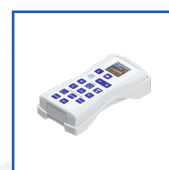
IR remote control