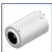
Camera: FULL-HD cable 4K cable