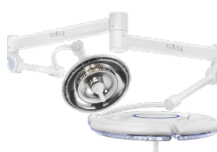
CEILING DOUBLE UNICA860+520