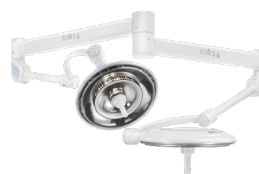
CEILING DOUBLE UNICA520+520