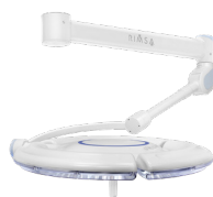
CEILING SINGLE UNICA860SO