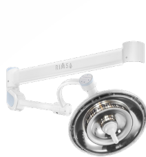
CEILING SINGLE UNICA520SO