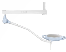
CEILING SINGLE PENTA12SO PENTA28SO