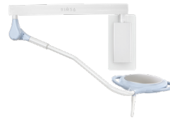
WALL MOUNTED PENTA12PA PENTA28PA