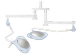
CEILING DOUBLE PENTA12+12 PENTA28+28