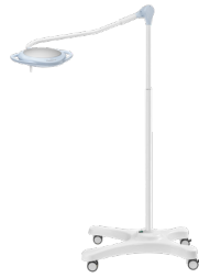
MOBILE PENTA12PI PENTA28PI